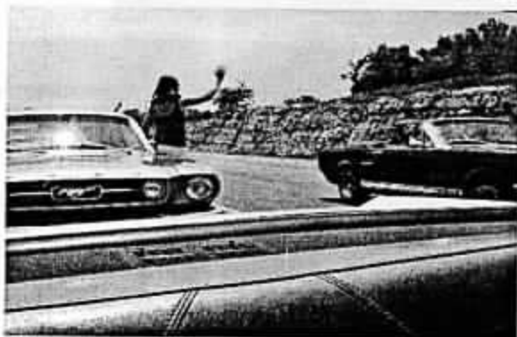
Kirsten Waving at Shelby