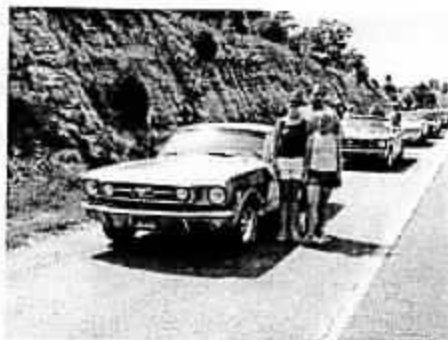
Line of Cars