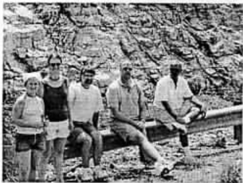
Boy are we Hot