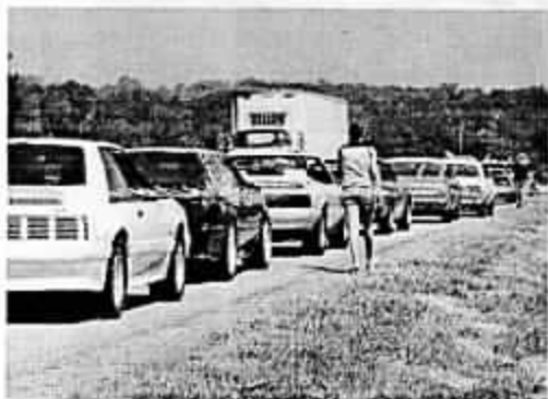
Line of Mustangs