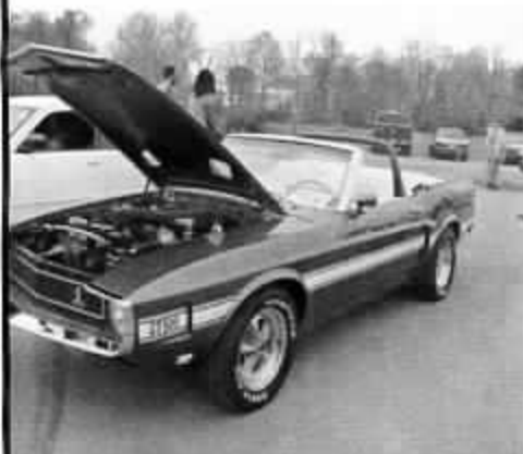
1969 Shelby GT500 Owned by Roger Clapp

Sept 22-23 Blue Angels Mid-South Air Show Millington TN, See Flyer Page 9