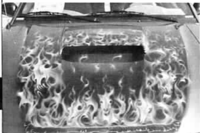
Mustang OK, April 2007