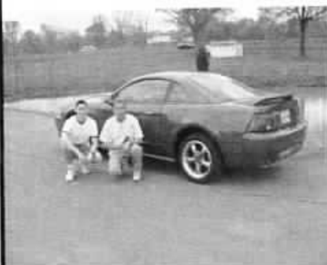
March Madness, March 2007 Clarksville, Tn.