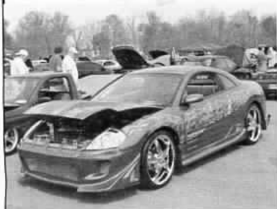
March Madness, March 2007