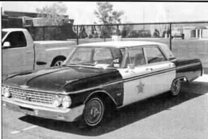
Mustang OK, April 2007